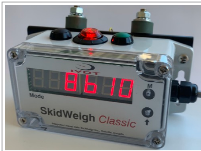
SC1-AT SkidWeigh Classic