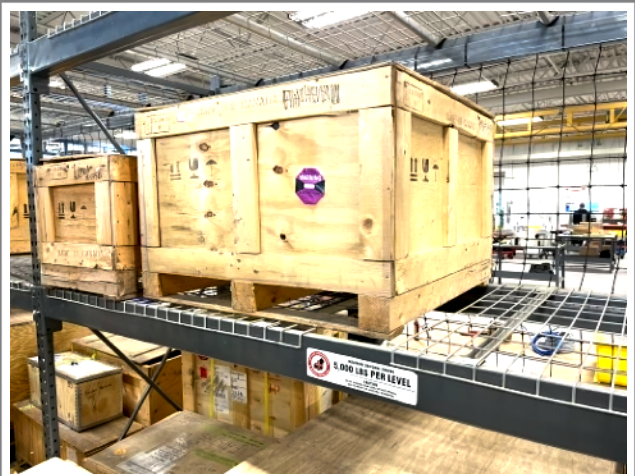
Racking Overload Prevention