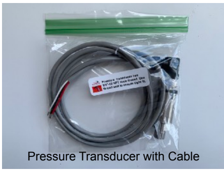
Pressure Transducer with Cable